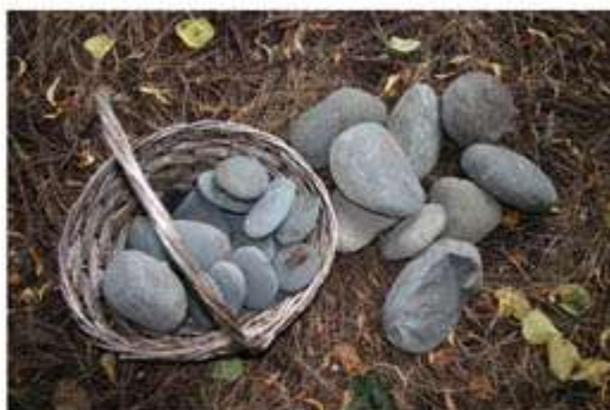
Large and medium sized stone pebbles

Other possible materials: flooring, wood blocks, kindling wood. Arrange next to an oblong shaped raked rectangle. Approx 10mx7m (depending on amount of materials and class size)