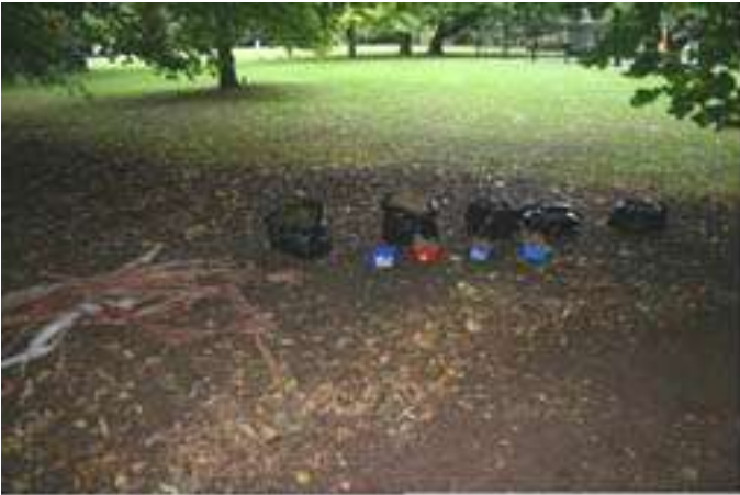
Items store well in old ice cream tubs and large bin bags. Arrange around the raked circle