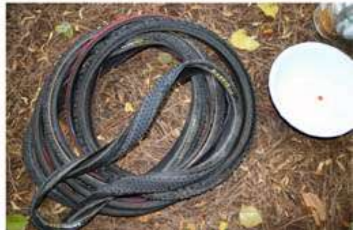
Road bike tyers and inflated innertubes. Act as guide for circle Land Art. Remove when work is completed.