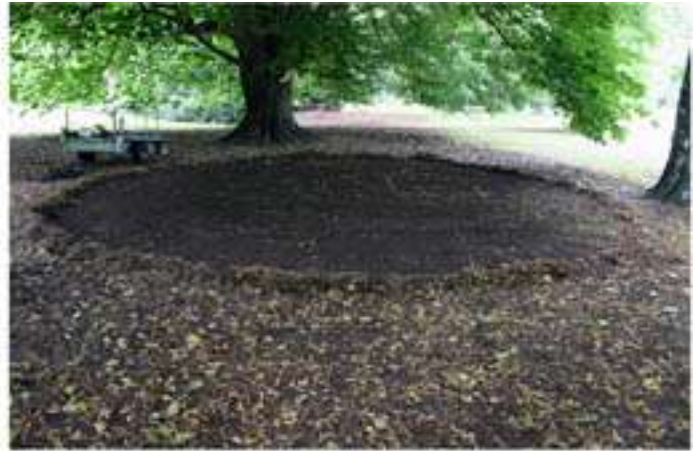
Raked circle for smaller works to be created in. ~ 5m radius (increase size if working with a larger class)