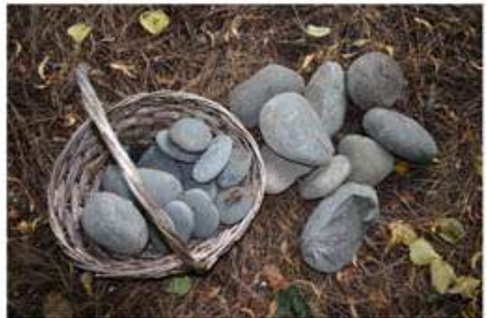
Different sizes of round/oval pebbles