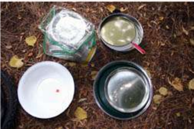
Containers for collection of materials and for smaller circle guides within tyre shapes