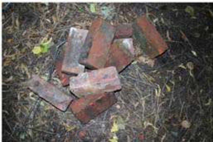
Old red bricks