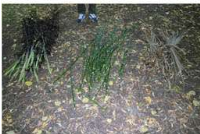
Set up distance