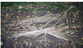
Thin bark for binding sticks together

Other useful materials: feathers, large green leaves, drift wood, found brightly coloured fruits, petals from flowers and ferns. Arrange around a large raked circle.